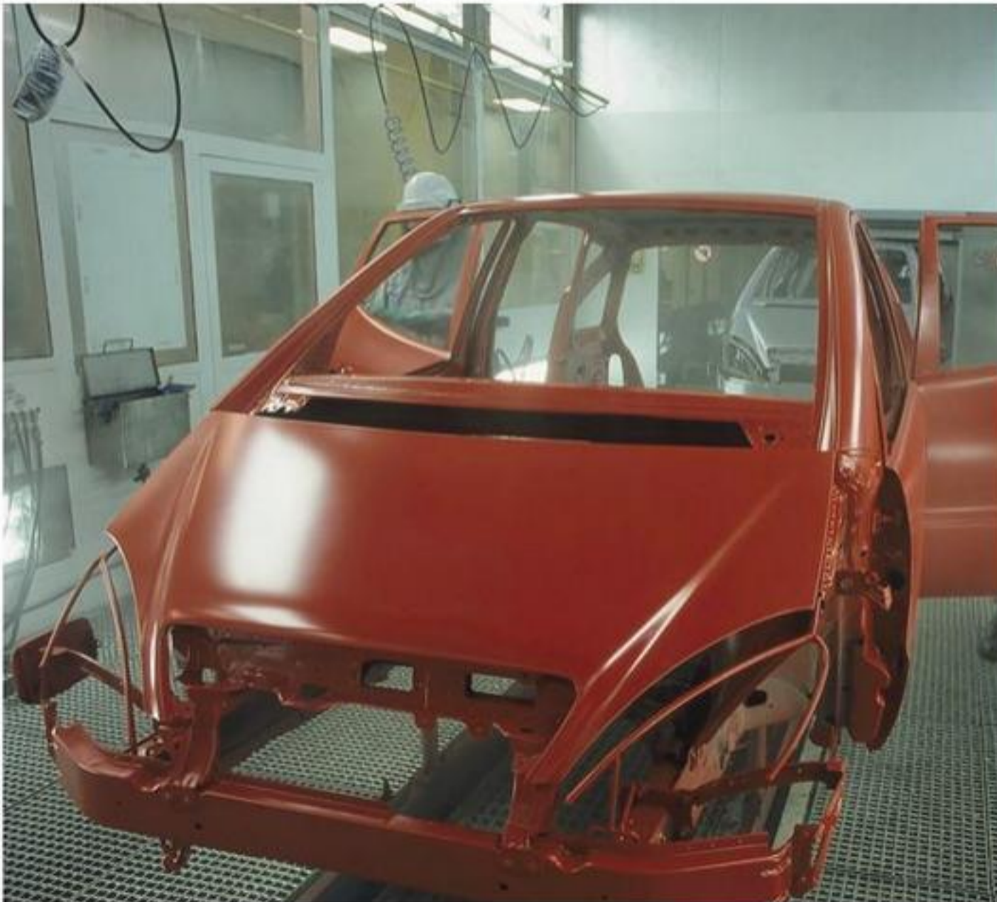
Car body after the painting process