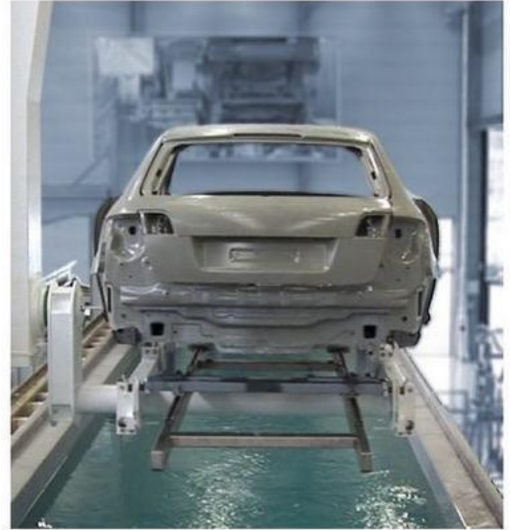
EPD painting process