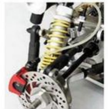
Typical applications: shopping trolley and brake line tubing