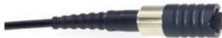
The ESG20 probe